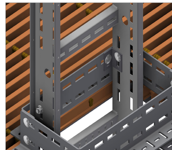
Ladder is attached using OE angle brackets.