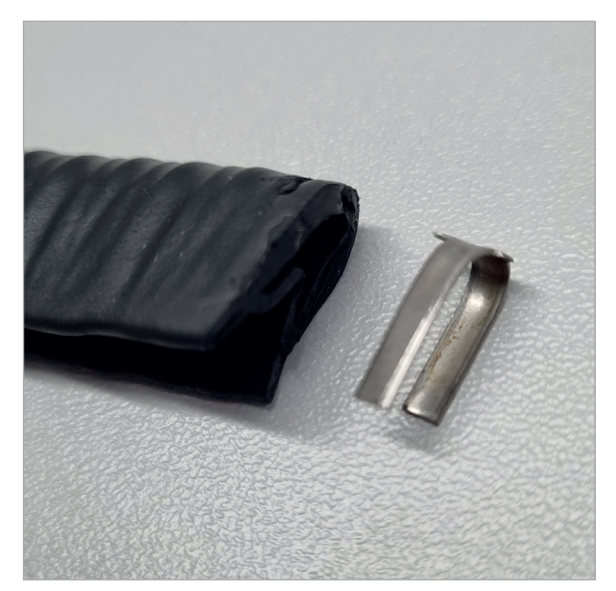
If metal is exposed, remove the outer section with pliers