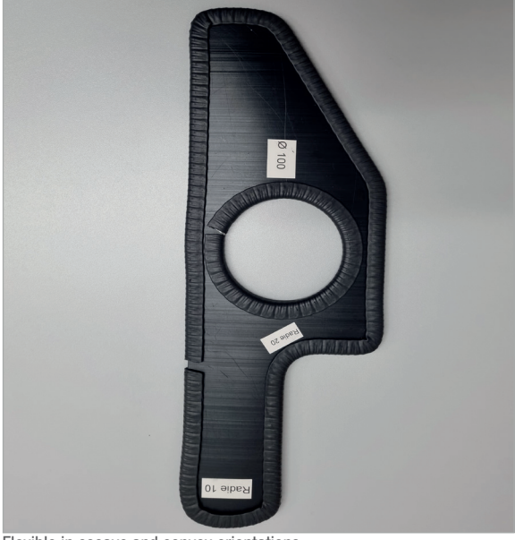
Flexible in cocave and convex orientations