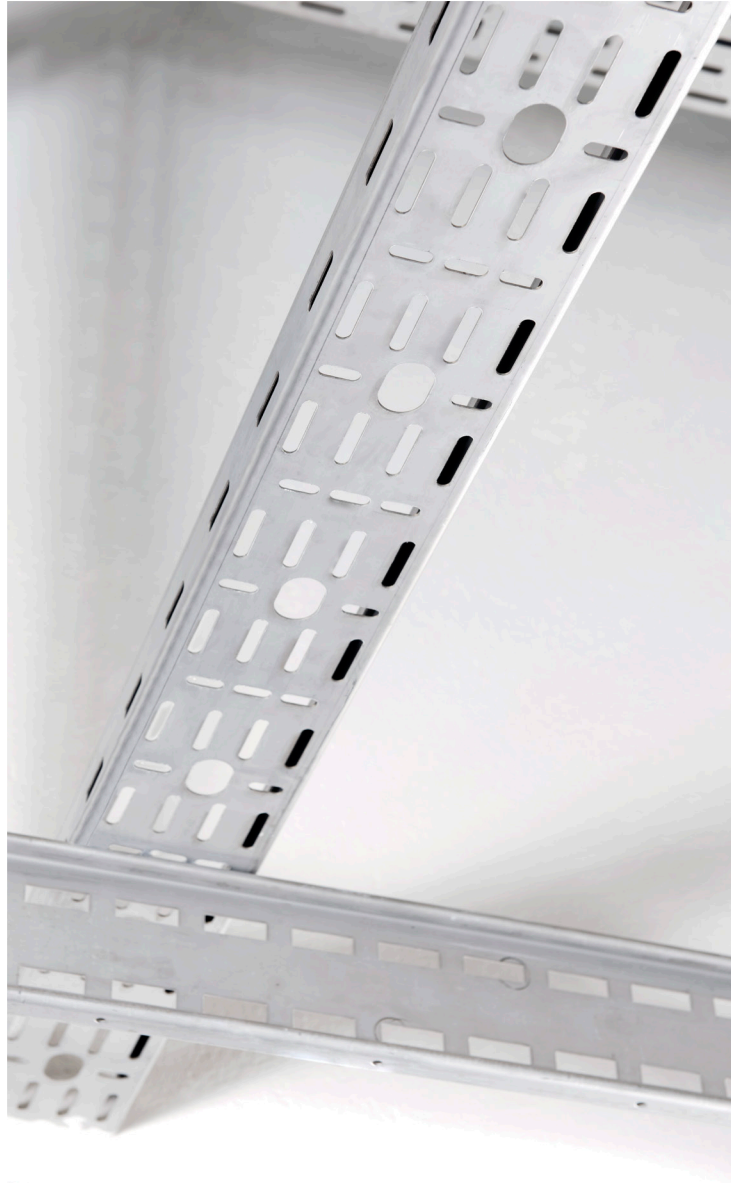
This poster shows the main/most used parts of the SPB-RF100 System. For a full overview of the SPB System view our products online: www.oglaend-system.com/selector