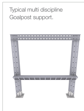
Typical multi discipline Goalpost support.