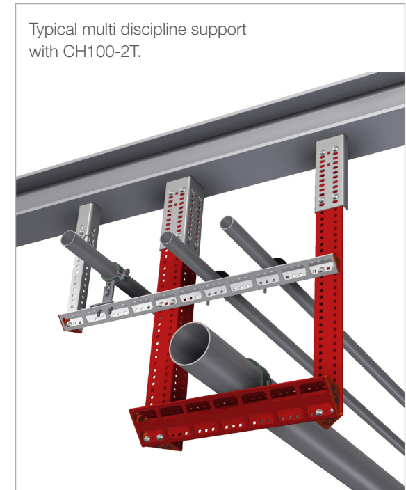
Typical multi discipline support with CH100-2T.