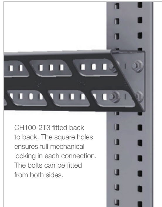
CH100-2T3 fitted back to back. The square holes ensures full mechanical locking in each connection. The bolts can be fitted from both sides.

Channels can be fitted back to back without additional brackets.