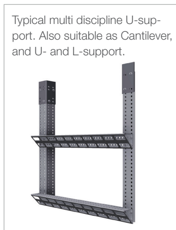
Typical multi discipline U-support. Also suitable as Cantilever, and U- and L-support.