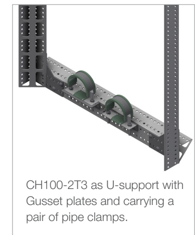
CH100-2T3 as U-support with Gusset plates and carrying a pair of pipe clamps.