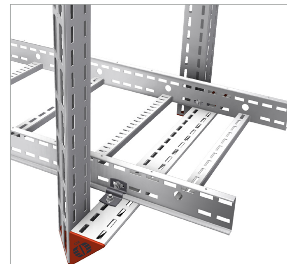
CH100-2T3 11x35 as U-support carrying a wide OE cable ladder. Plastic end protectors are available.