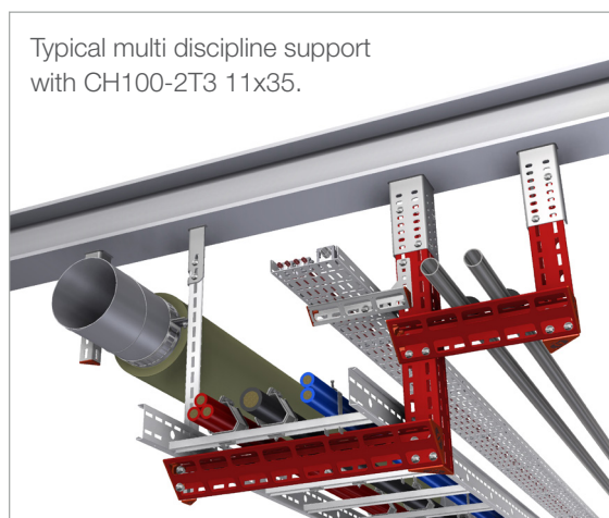
Typical multi discipline support with CH100-2T3 11x35.