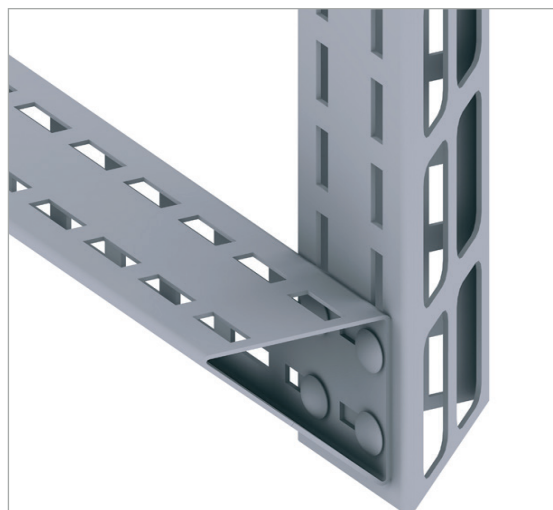
CH100-2T3 11x35 fitted back to back. The large holes on one side of the triangle channel make the channel easy to assemble. The bolts can be fitted from both sides.