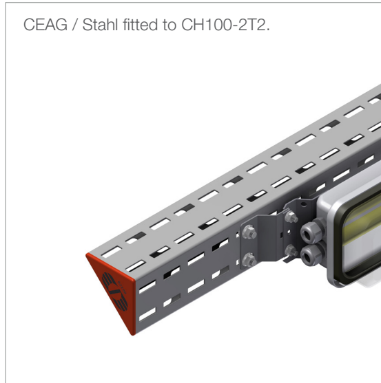
CEAG / Stahl fitted to CH100-2T2.

User Guide for Bolts: Recommended Torque