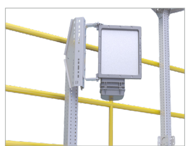
Fitted to vertical pole.