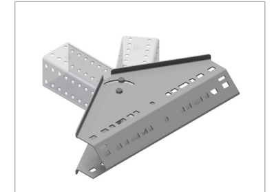
Adjustment slot with 210° rotation.