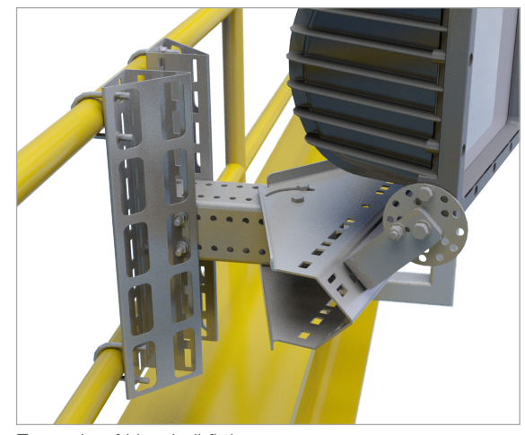
Example of Handrail fitting.