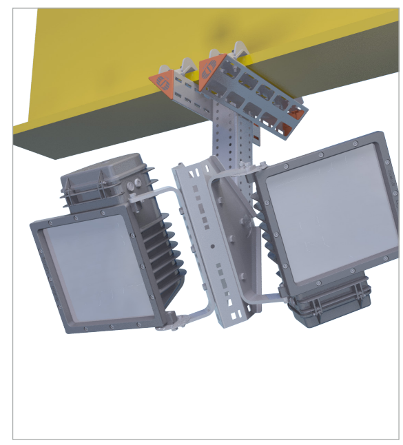
Fitted from H-beam. Possibility to fix two floodlights.