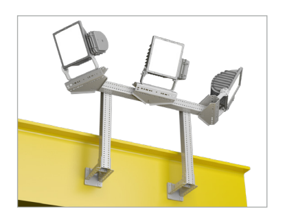
Hugely adaptable design.