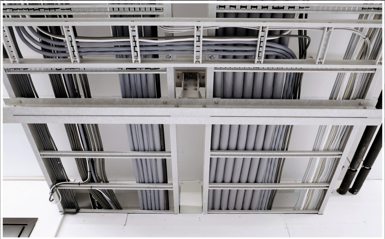
Photo: Fiberglass installation at Bremnes Seashore in Trovåg, Norway.

Oglaend System's products and systems in FRP/GRP material offer the best possible protection for today's demanding environments. Our support channels are designed to deliver weight reductions while maintaining strength and maximising loading capacity.