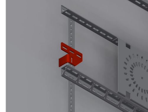
Bracket for achitecture wall