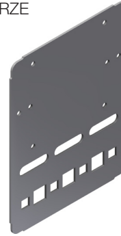
Socket plate for RZE ladder.

If a 90° angle is desired, bend the plate manually after it has been installed on the ladder.