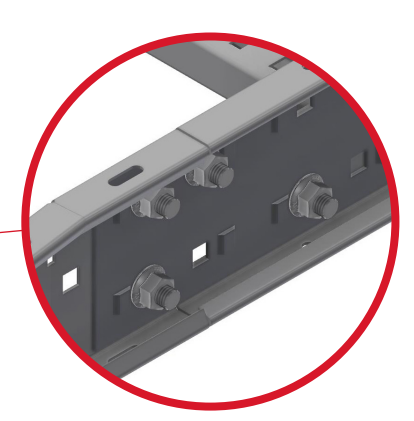
When attaching a Fitting to a Ladder: Turn the splice so the notches face outwards